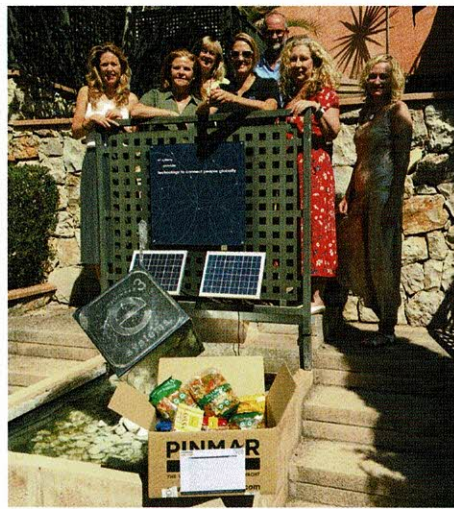
The e3 team

We have also been given many other items (towels, pillows, clothing, galley equipment etc.) which have been extremely useful either directly for the charities themselves or to be exchanged for food.